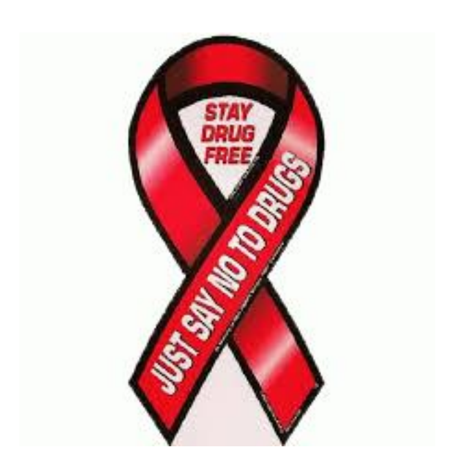
"DEAD spells out Drugs End All Dreams."